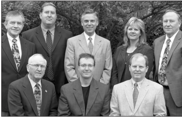
Honored for their innovative partnerships, representatives of Mapleton City and Harvest Park Development are all smiles as they pose with Governor Huntsman.

At the fifth annual Envision Utah Governor's Quality Growth Awards, held May 18th, eleven innovative efforts from around the state were honored for their efforts to respond to growth pressures and preserve Utah's high quality of life.